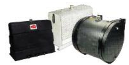
Hydraulic Oil Reservoirs